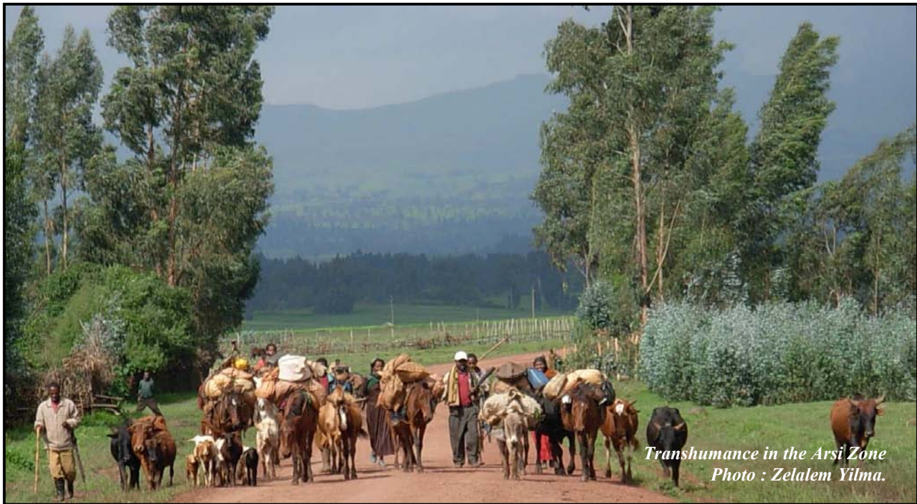
Transhumance in the Arsi Zone

Although the highlands in general and some other areas in mid altitude have a reasonable potential for the cultivation of food crops and to grow good quality pasture grasses, large areas including very sloppy ones are under cultivation and those which have not